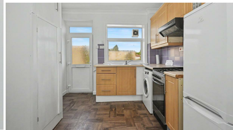
A first floor apartment in Warwick, well maintained and recently redecorated throughout with new carpets.